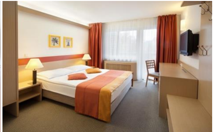
3* Hotel Savica

All rooms have balcony, air conditioning, minibar, TV and internet access.