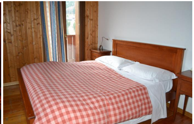
3* Hotel Raibl

Rooms have individual facilities and hotels offer several free parking places.