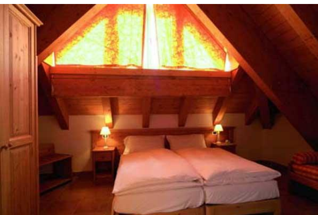
3* Hotel Haberl