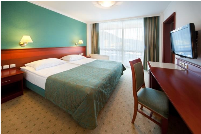
4*S Hotel Golf (rooms w/lake and park view)

3* Hotel Savica in short walking distance (100 m) to Hotel Golf is a friendly hotel with 104 rooms and suites with 260 total number of beds.