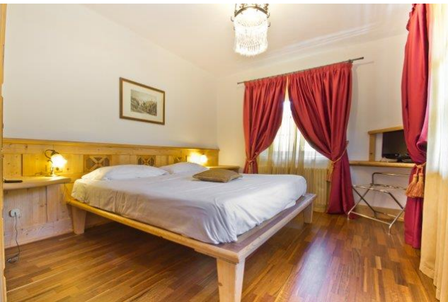
4* Hotel Edelhof

Characteristic for Tarvisio are many 3* and 4* hotels with 15 – 50 rooms. The atmosphere is very familiar and hospitality and food are great. Several hotels mentioned below were checked during inspection and in total Tarvisio has of course enough capacity for the event.