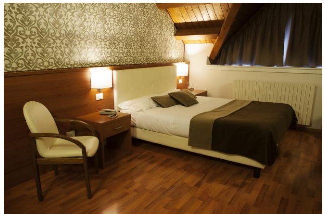
4* Hotel Cerva